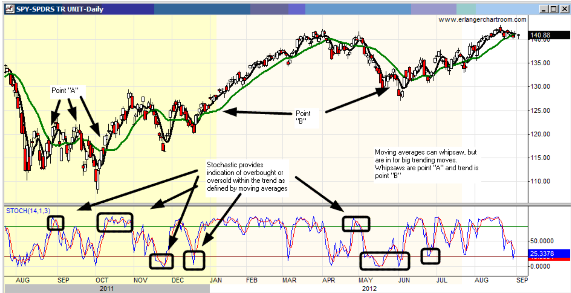
Chart: "Basic" External Momentum Indicator